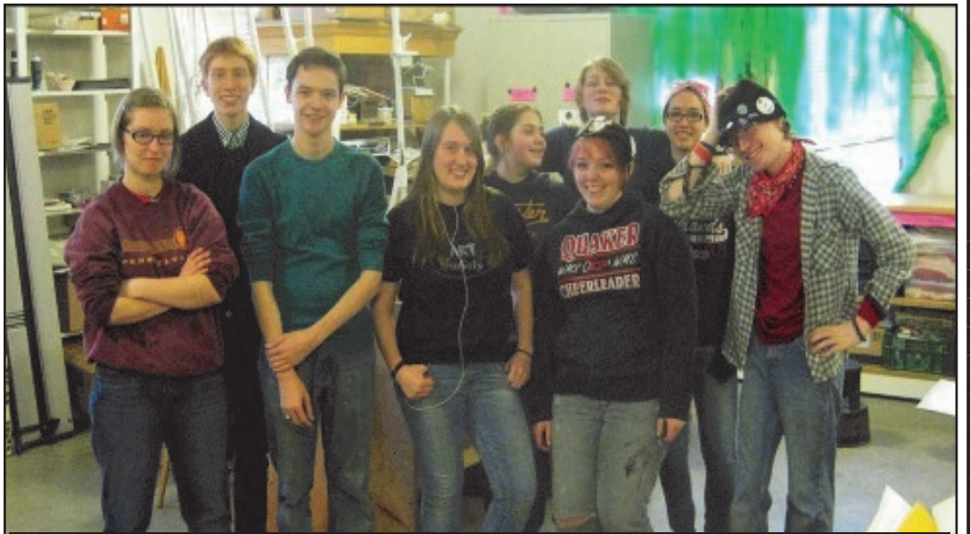
FAVA is ever grateful to these “art angels” for restoring their studio:

FAVA, the Firelands Association for the Visual Arts, in Oberlin was in desperate need of a studio overhaul. Their classroom was overflowing with art materials and furniture that needed to be managed. Yarn needed to be untangled, the sink scoured, the floor cleaned, paint and glue refilled and shelves sorted and stocked. It would take a small army to “reset” the studio to be ready for spring semester classes. That small army was the FHS Art Society! The students performed this kind act of community service afterschool on Jan. 22 and all day Sat. Feb. 1. The studio now has a functional space, thanks to the helpful hands in Art Society.